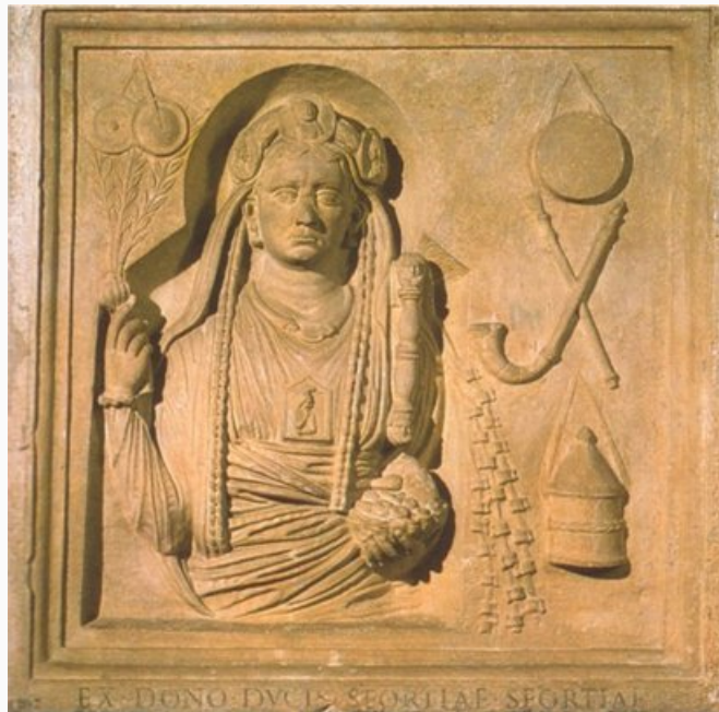
Cybele or one of her archigalli priests

Cult prostitutes were not gays and lesbians. They were usually heterosexuals who used anal sex to worship the Canaanite fertility goddess. There is no rational analogy between pagan worship of false gods and the loving lesbian and gay relationships we see today.