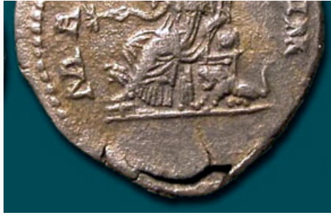
A Cybele coin,

circulated in first century Rome, where Cybele is referred to as "Mater Deum" meaning "Mother of the gods." Think about it for a minute. Cybele coins similar to the one pictured here were circulating in the Roman Empire for at least 75 years before the birth of Christ and for two hundred years afterward.