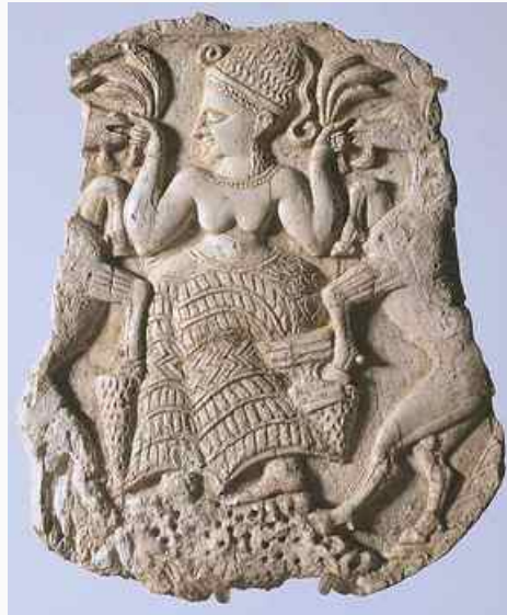
Ancient Canaanite fertility goddess

The people doing the reinterpretation are anti-gay Christians who departed from the Biblical witness and from traditional Jewish and Christian teaching. They are the ones who have reinterpreted verses about cult prostitutes. They now allege that verses about cult prostitution actually refer to committed, faithful, non-cultic same sex relationships as we know them in modern times.